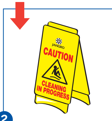
2 Place safety signs.