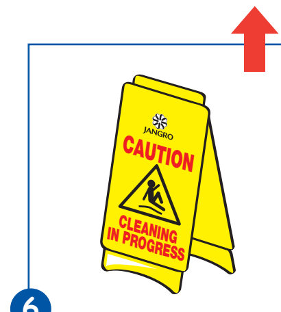
6 Remove safety signs.

Health & Safety Please refer to relevant COSHH Sheet.