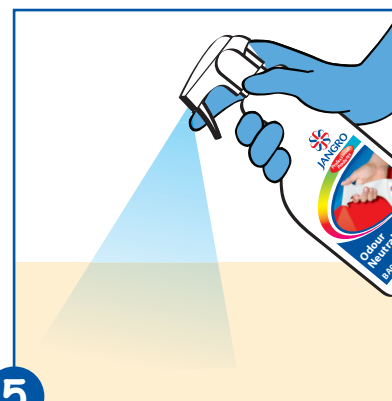
5 Spray surface liberally.