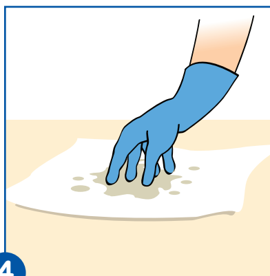
4 Blot with paper towel.